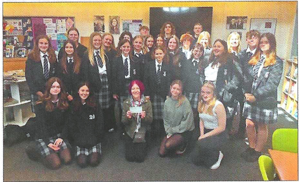
Felpham Community College presented a £1000 cheque from proceeds of their talent show to the Save Felpham Village Post Office Campaign.